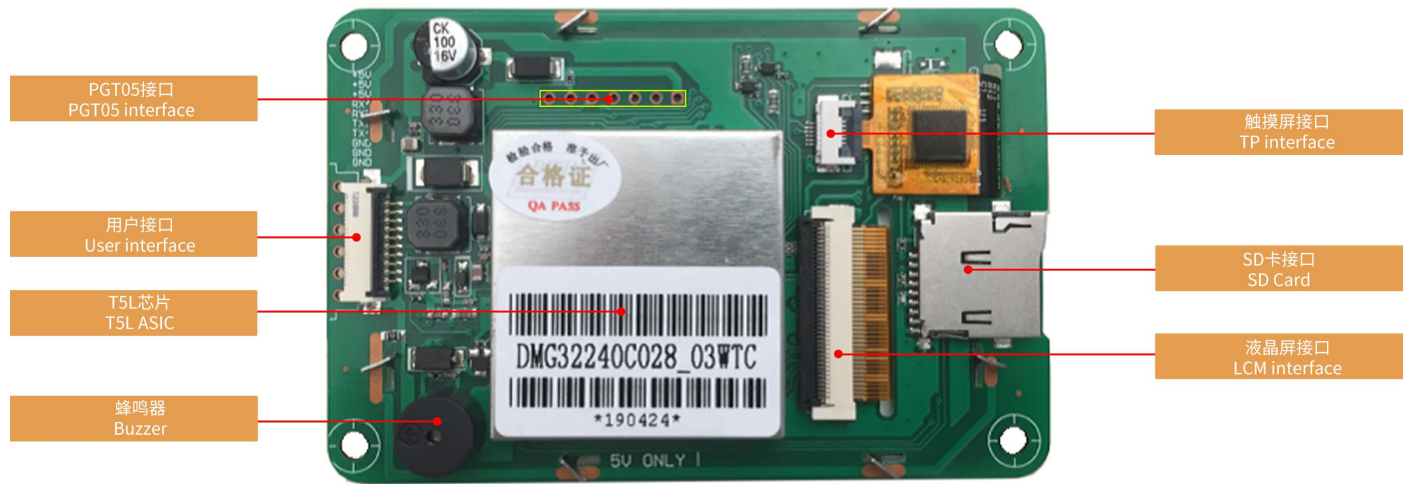
硬件接口图 Hardware interface