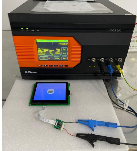
3.2 群脉冲测试图 EFT test

the performance is in line with the criteria GB/T 17626.2 B level and above.